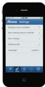
iOS, Android compatible