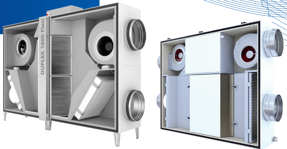
DUPLEX Flexi and DUPLEX EC5

ATREA is a leading company in ventilation and heat recovery. ATREA means top quality, continuous innovation, excellent performance and sensitive partnership approach. Thanks to all these advantages ATREA provides products near to state of art. As a result of deep technical knowledge, long tradition and constant market attention ATREA products are well known in all Europe and introductory negotiations are taking place with customers from overseas.