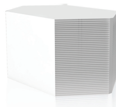
Own production of plate counterflow heat recovery exchangers